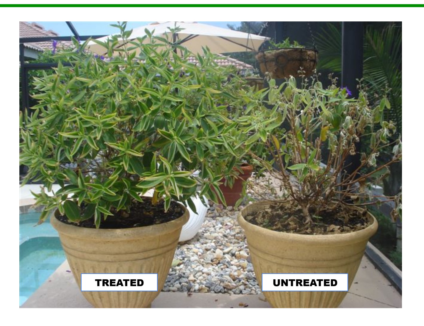
After 1 Week without Water