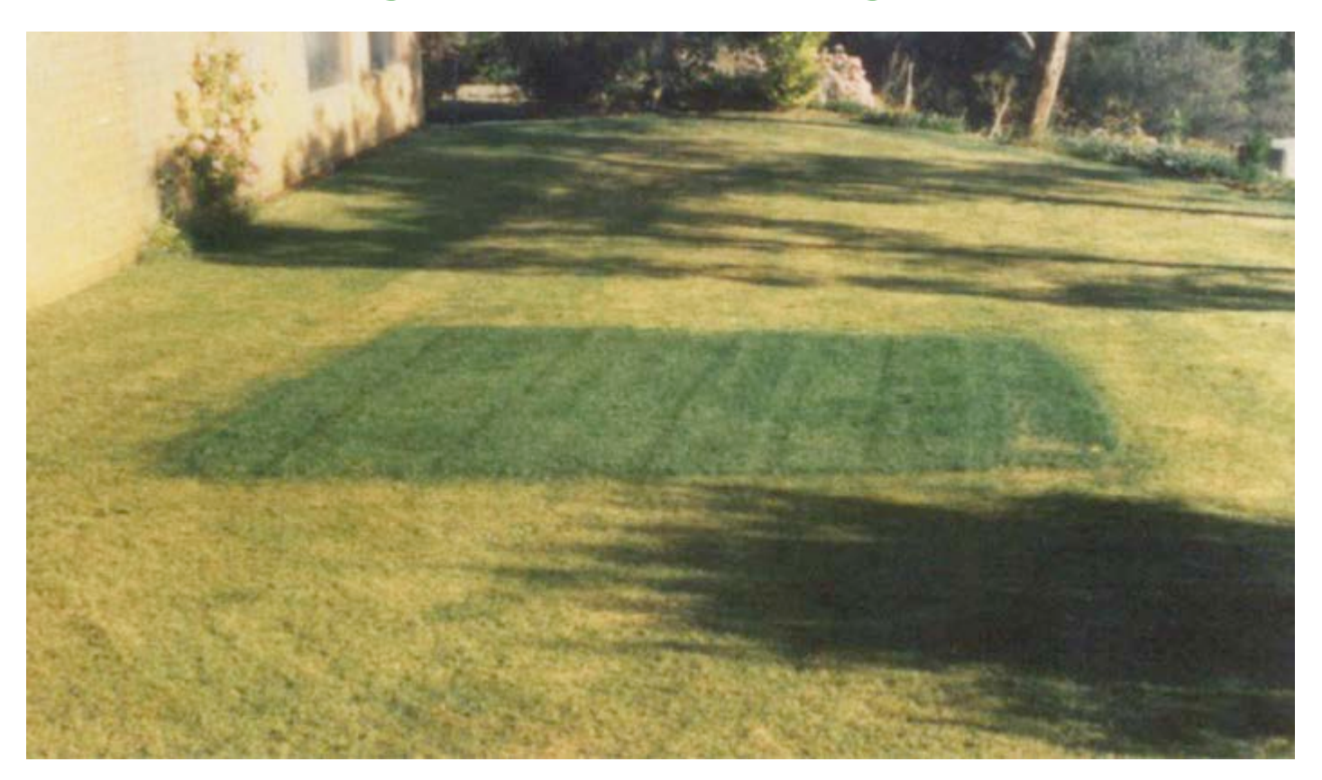
The entire lawn was as green and healthy looking as the center section prior to a six week drought.