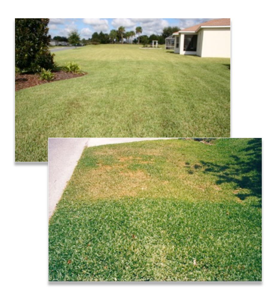
Side by Side Comparisons of Treated and Untreated St. Augustine Lawns