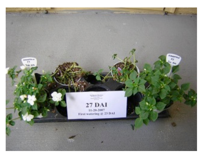
Day 27:First Watering at Day 23