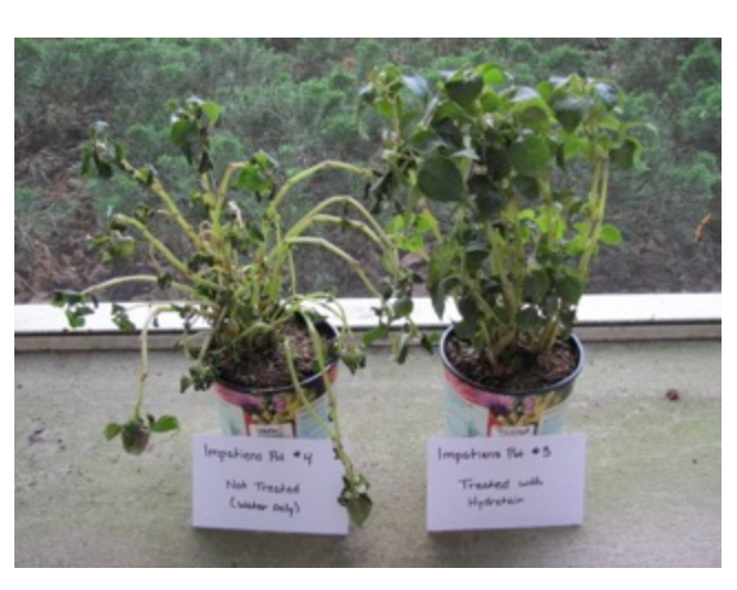
Day 12: First Watering at Day 6